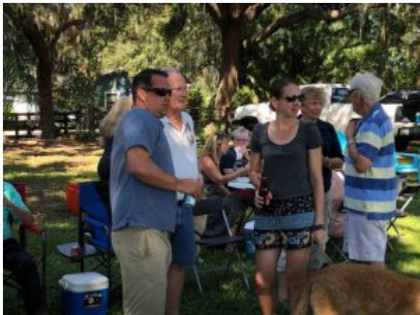
Even more friends