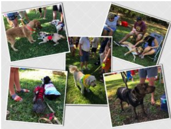
Some of the Howl-O-Ween Contestants