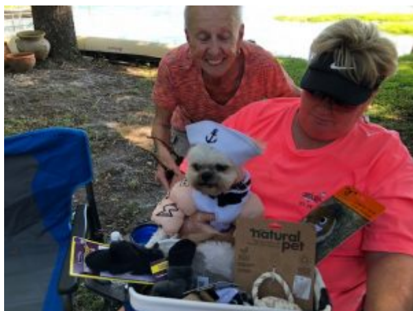
Petey, winner of the Howl-O-Ween Contest