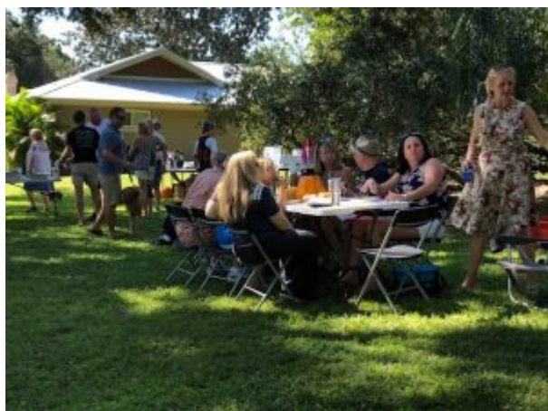
Visiting with old and new friends